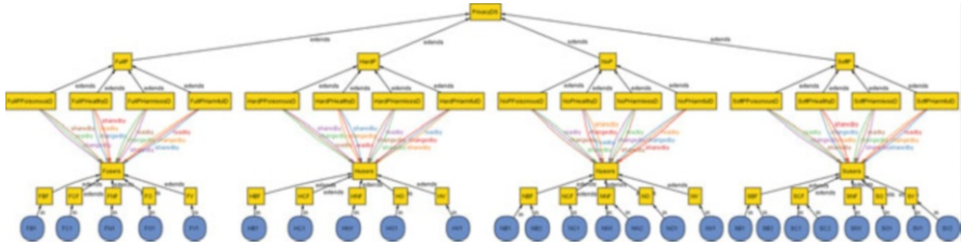
Fig. 5.1 The UPP+ meta model