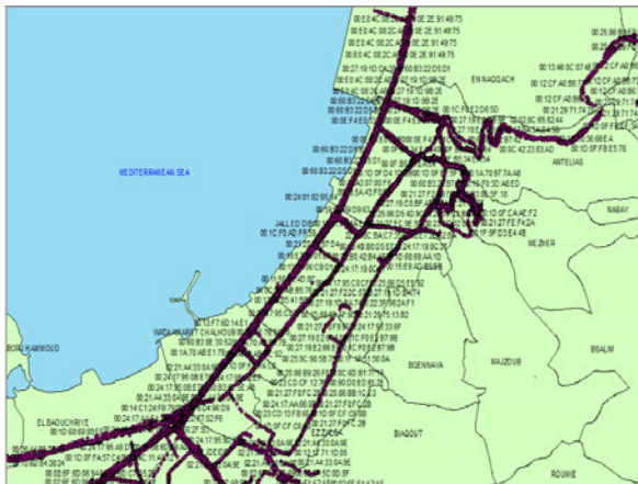
Fig. 1 The Wi-Fi layer.

The Wi-Fi layer, shown in figure 1, portrays all the locations where Wi-Fi data are collected. This data will be processed into 30 to 50 meter buffers; thus, making it easier to visualize and query. Besides the above layers, the GSM and Wi-Fi information collected from the mobile device will be used as raw data, for information support system used by decision/policy makers.